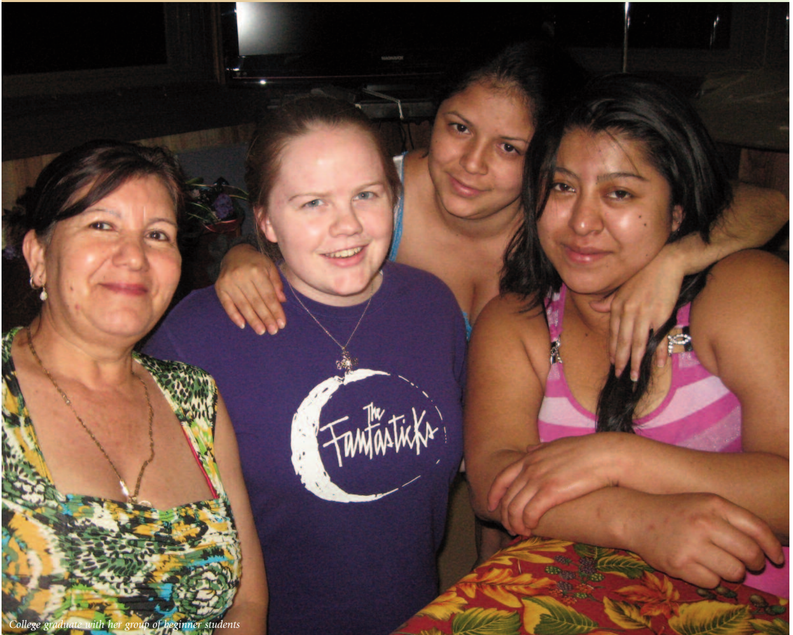
College graduate with her group of beginner students